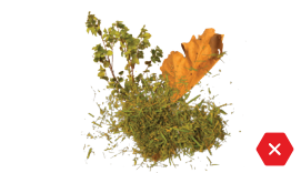
NO Green Waste