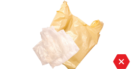
NO Loose Plastic Bags, Bagged Recyclables or Film Empty recyclables directly into your bin.