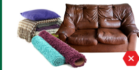
NO Clothing, Furniture & Carpet