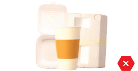
NO Foam Cups & Containers